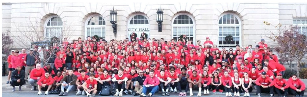
D&E Senator Nation athletes and coaches continue the tradition of giving back to the City of Elkins on Community Engagement Day.